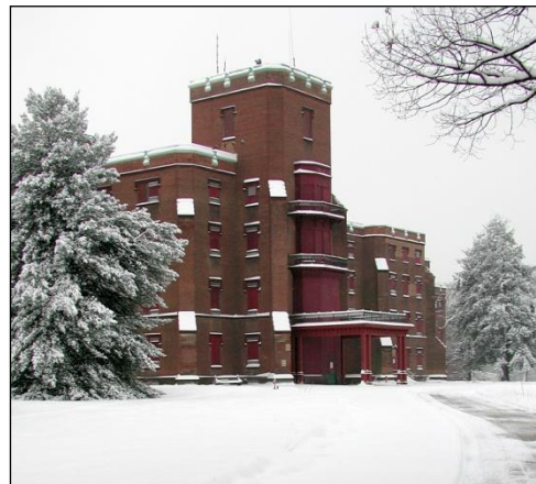
Center Building, 2003

The hospital boomed in the first half of the twentieth century, only to face a steady decline in patient population and services in the second. The hospital was the only government facility to treat mentally ill military personnel until 1919, and World War II brought in the largest patient numbers in its history. In 1946, however, Congress ended the long association between the hospital and the armed forces, in favor of treatment at the nation's expanding system of veteran's hospitals. District patients and other federal dependents remained, but advances in psychopharmacology, the development of community-based alternatives to institutionalization, and new attitudes toward mental health care subsequently reduced the need for large public mental hospitals. Although the establishment of the National Institutes of