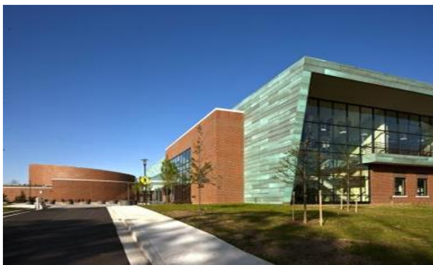
Saint Elizabeths Hospital Building

As the patient population continued to decrease, the hospital closed numerous vacant buildings and consolidated all services to city-owned land. The historic west campus was taken by the federal government to become the headquarters for the Department of Homeland Security, and the hospital's functions were consolidated to the east campus. In 2005, the hospital broke ground on a new state-of-the-art building on the east campus, the goals being to unify the hospital's functions and modernize the care and living conditions for the hospital's patient population.