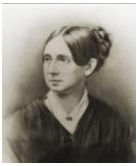
Dorothea Lynde Dix