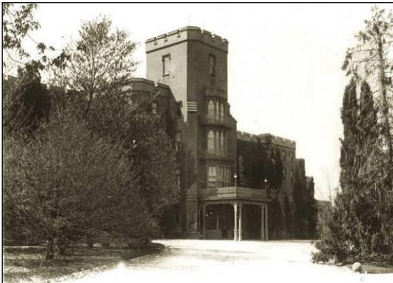
Center Building, 1996

new forms of treatment, such as art therapy, psychodrama, and dance therapy. It also contributed to the development of forensic psychiatry as a specialty and was a strong voice in the creation of forensic case law and mental health legislation. For example, its superintendents from the beginning opposed the requirement of a public jury trial in all lunacy proceedings in the District of Columbia, eventually leading, in 1938, to federal legislation creating a Commission on Mental Health and the authorization of private commitment hearings.