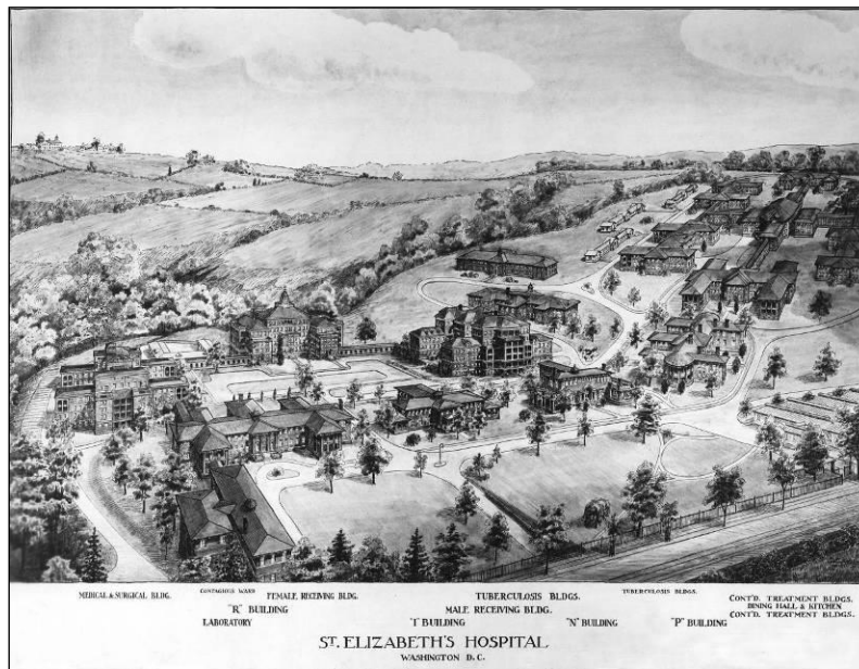
1916 Architect's Sketch of Saint Elizabeths Hospital

beauty through which the gods might wander....Indeed, it is one of the most attractive parks within the District of Columbia.”