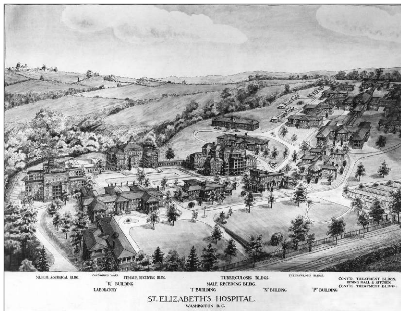
1916 Architect's Sketch of Saint Elizabeths Hospital