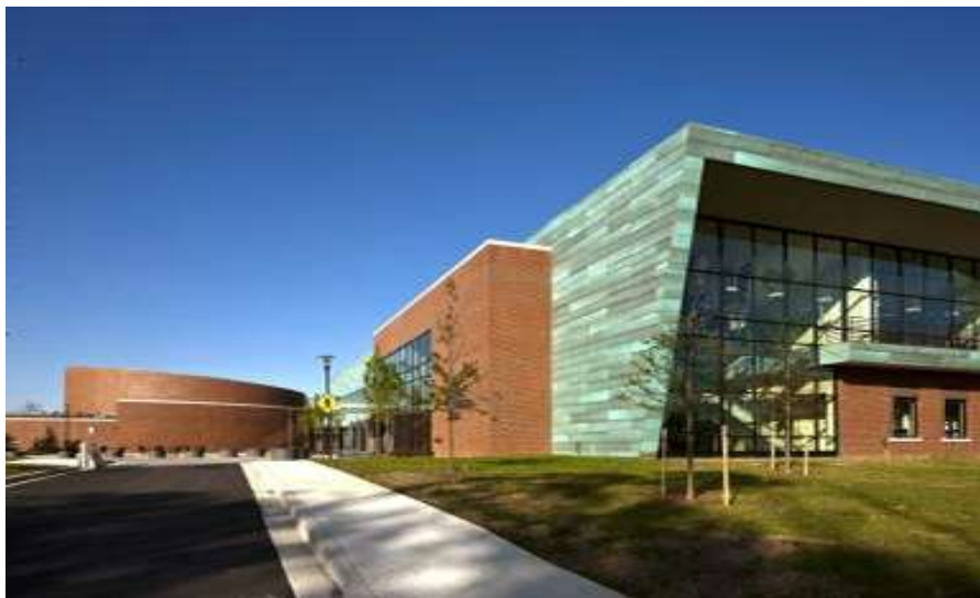
Saint Elizabeths Hospital Building

As the patient population continued to decrease, the hospital closed numerous vacant buildings and consolidated all services to city-owned land. The historic west campus was taken by the federal government to become the headquarters for the Department of Homeland Security, and the hospital's functions were consolidated to the east campus. In 2005, the hospital broke ground on a new state-of-the-art building on the east campus, the goals being to unify the hospital's functions and modernize the care and living conditions for the hospital's patient population.