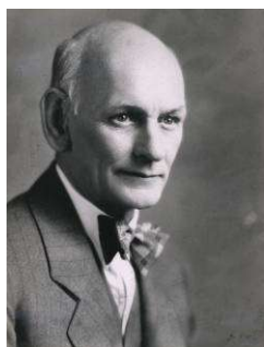
Shepherd Ivory Franz, Ph.D.

Dr. White ushered in the scientific era at the hospital. An integral part of this process involved establishing a Psychology Department at Saint Elizabeths as “an expression of the most advanced trends in modern psychiatry.” He strongly believed that the hospital “... should add its quota to the sum of knowledge on this very important subject.” At the same time, Dr. White recognized that “the methods of normal psychology must be modified to suit the changed conditions.”