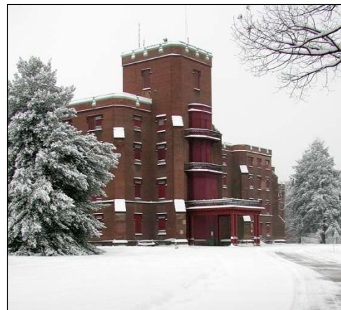
Center Building, 2003

The hospital boomed in the first half of the twentieth century, only to face a steady decline in patient population and services in the second. The hospital was the only government facility to treat mentally ill military personnel until 1919, and World War II brought in the largest patient numbers in its history. In 1946, however, Congress ended the long association between the hospital and the armed forces, in favor of treatment at the nation's expanding system of veteran's hospitals. District patients and other federal dependents remained, but advances in psychopharmacology, the development of community-based alternatives to institutionalization, and new attitudes toward mental health care subsequently reduced the need for large public mental hospitals. Although the establishment of the National Institutes of Mental Health's Neuroscience Center on the hospital grounds in 1971 continued the tradition of pioneering research on the campus, it did nothing to stave off falling patient numbers.