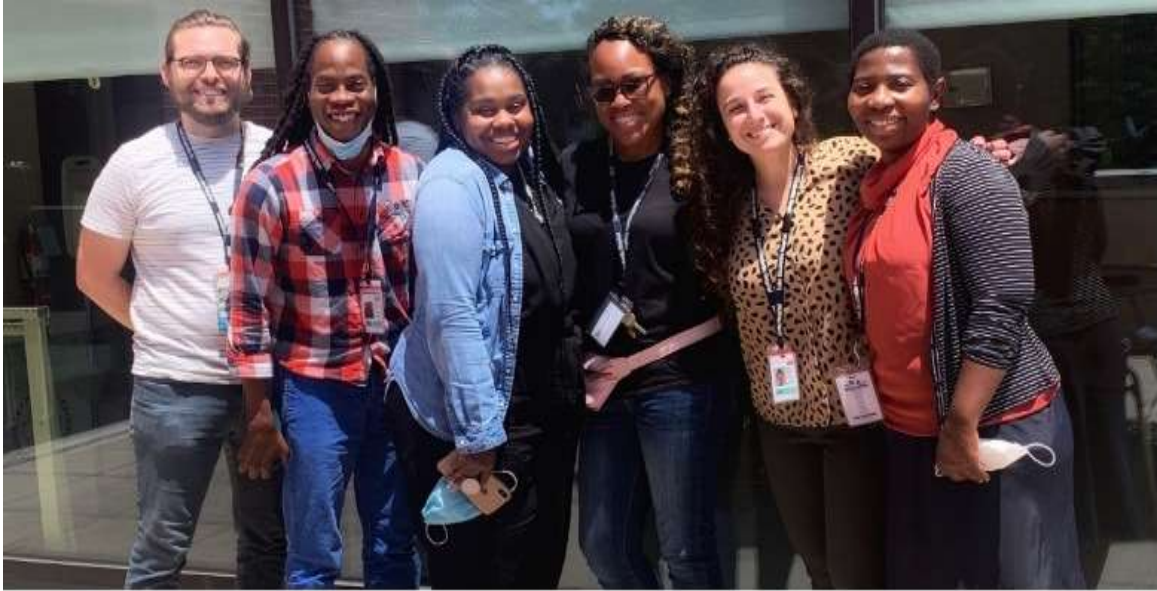
Internship Class of 2021