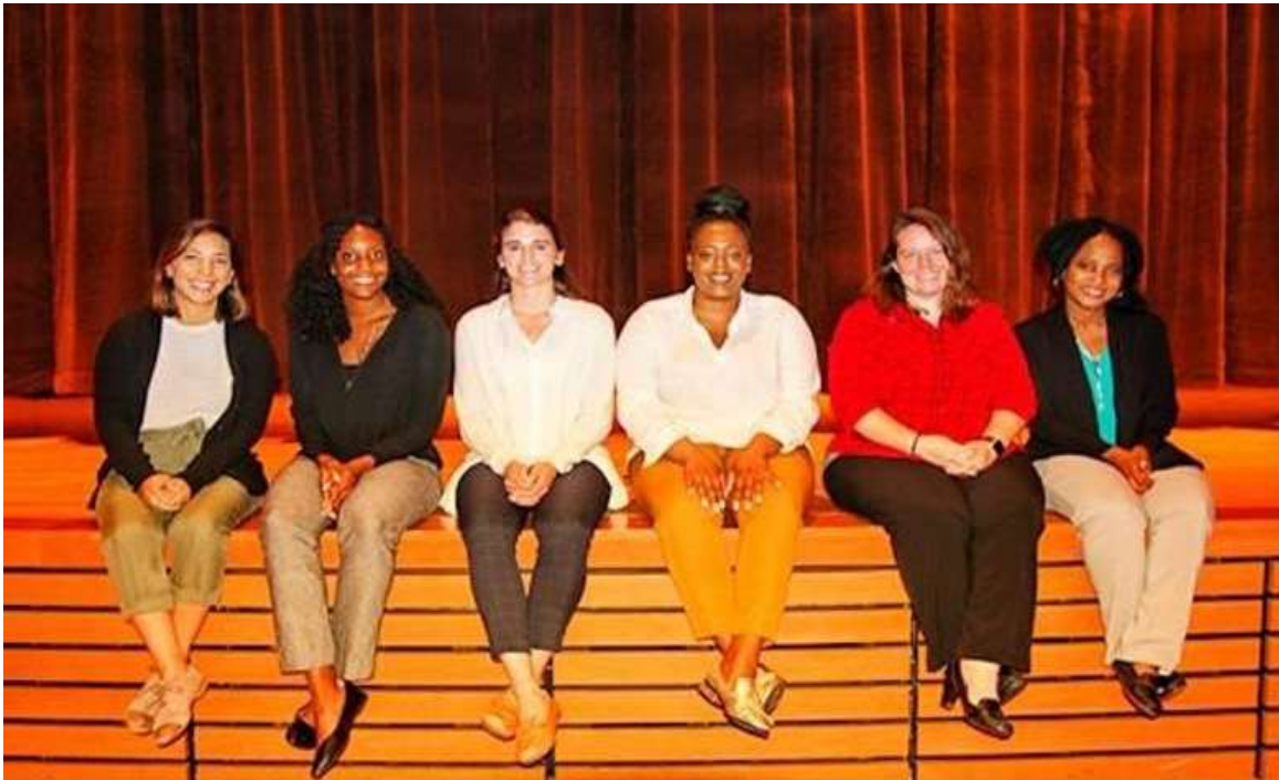
Internship Class of 2020