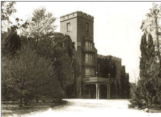
Center Building, 1896

new forms of treatment, such as art therapy, psychodrama, and dance therapy. It also contributed to the development of forensic psychiatry as a specialty and was a strong voice in the creation of forensic case law and mental health legislation. For example, its superintendents from the beginning opposed the requirement of a public jury trial in all lunacy proceedings in the District of Columbia, eventually leading, in 1938, to federal legislation creating a Commission on Mental Health and the authorization of private commitment hearings.