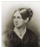
Dorothea Lynde Dix