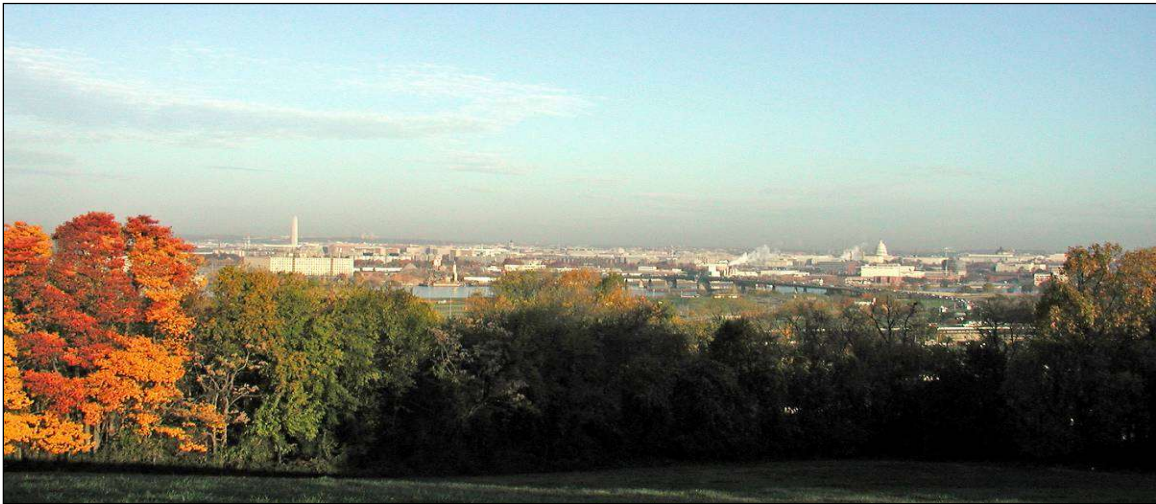
View from the Point, West Campus, Saint Elizabeths Hospital